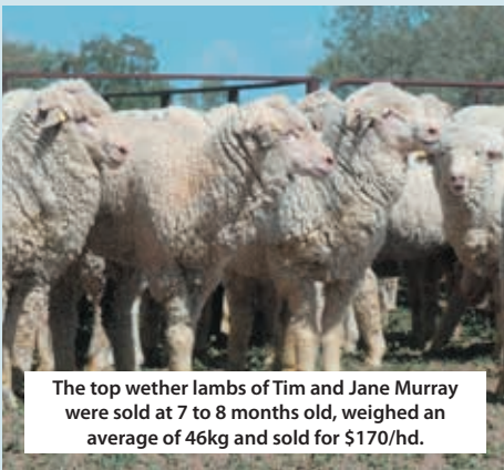
The top wether lambs of Tim and Jane Murray were sold at 7 to 8 months old, weighed an average of 46kg and sold for $170/hd.